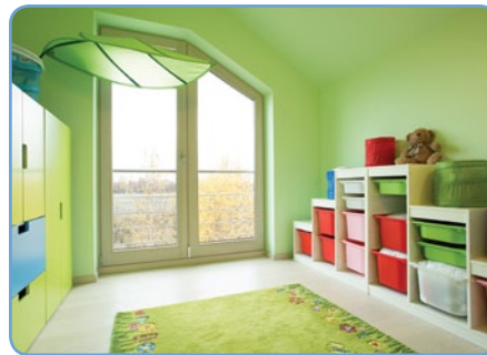
Paints and Coatings