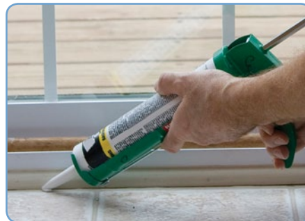
Adhesives, Caulks and Sealants