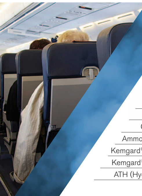
ISO 5660 Total Smoke in Rigid PVC Compound