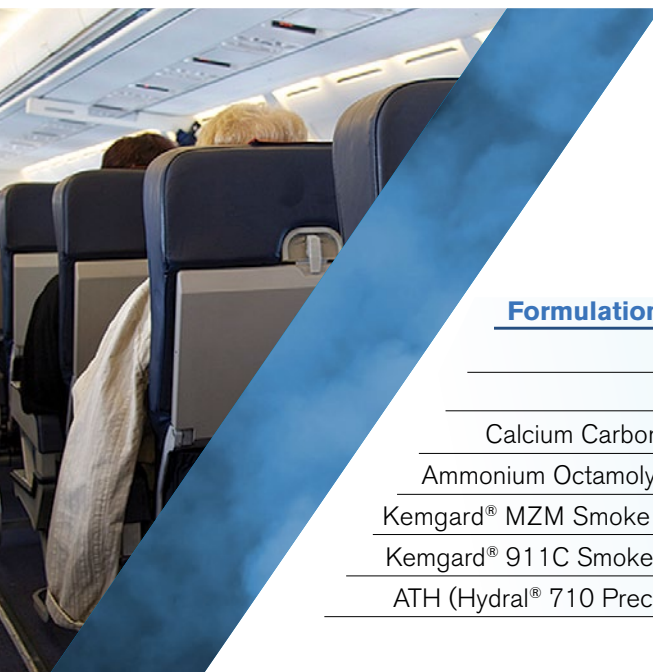
ISO 5660 Total Smoke in Rigid PVC Compound